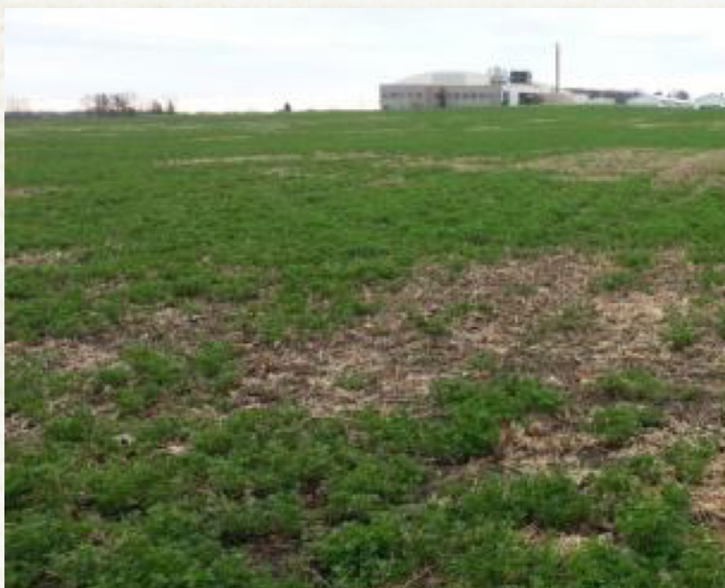
Alfalfa stand with winter damage.

Plants that have been damaged slightly may have a little browning at the crown and slight yellowing of the root but will still grow well. Plants that are severely damaged will have dead crowns and yellow-brown, sometimes hollow and spongy roots. If the great majority of your alfalfa plants are dead, your decision is straightforward. Stands with some damaged and dead plants need further evaluation.