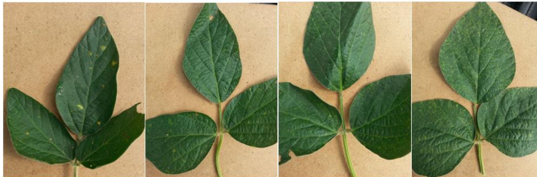
Image 1. Foliar disease infection scale increasing from 1 (left) to 4 (right). Rating of 5 not observed.

Yield data and stand characteristics were analyzed using mixed model analysis using the mixed procedure of SAS (SAS Institute, 1999). Replications within trials were treated as random effects, and hybrids were treated as fixed. Hybrid mean comparisons were made using the Least Significant Difference (LSD) procedure when the F-test was considered significant ( p < 0.10 ). Variations in yield and quality can occur because of variations in genetics, soil, weather, and other growing conditions. Statistical analysis makes it possible to determine whether a difference among hybrids is real or whether it might have occurred due to other variations in the field. At the bottom of each table a LSD value is presented for each variable (i.e. yield). Least Significant Differences (LSDs) at the 0.10 level of significance are shown. Where the difference between two hybrids within a column is equal to or greater than the LSD value at the bottom of the column, you can be sure that for 9 out of 10 times, there is a real difference between the two hybrids. In this example, hybrid C is significantly different from hybrid A but not from hybrid B. The difference between C and B is equal to 1.5, which is less than the LSD value of