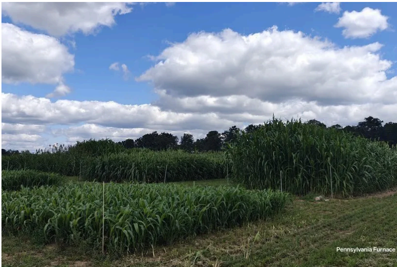
Forage variety trials at Rock Springs Research Farm, Pennsylvania Furnace, PA

The report includes results from alfalfa, clovers, perennial cool-season grasses, annual cool-season grasses, annual warm-season grasses, and short-lived winter forages and cover crops established at the Russell E. Larson Agricultural Research Center at Rock Springs, as well as alfalfa trials at the Southeast Research and Extension Center at Landisville.